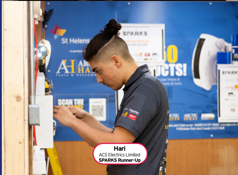
Hari ACS Electrics Limited SPARKS Runner-Up