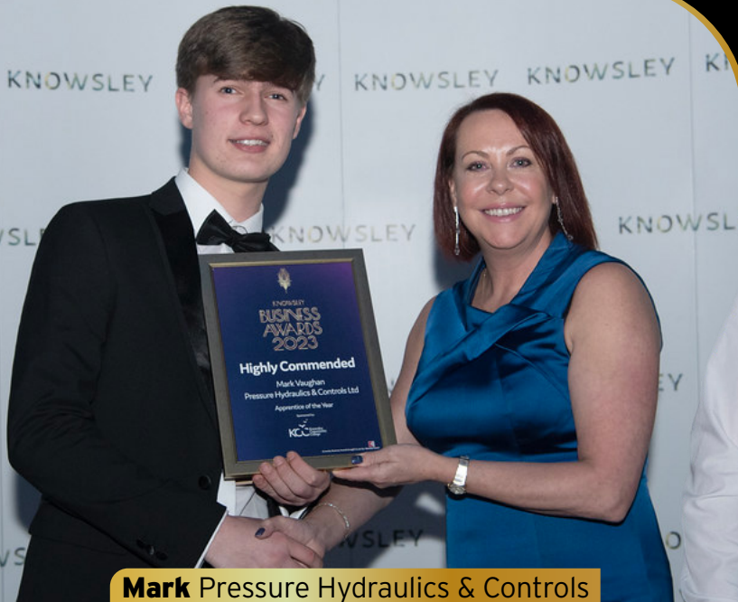
Mark Pressure Hydraulics & Controls