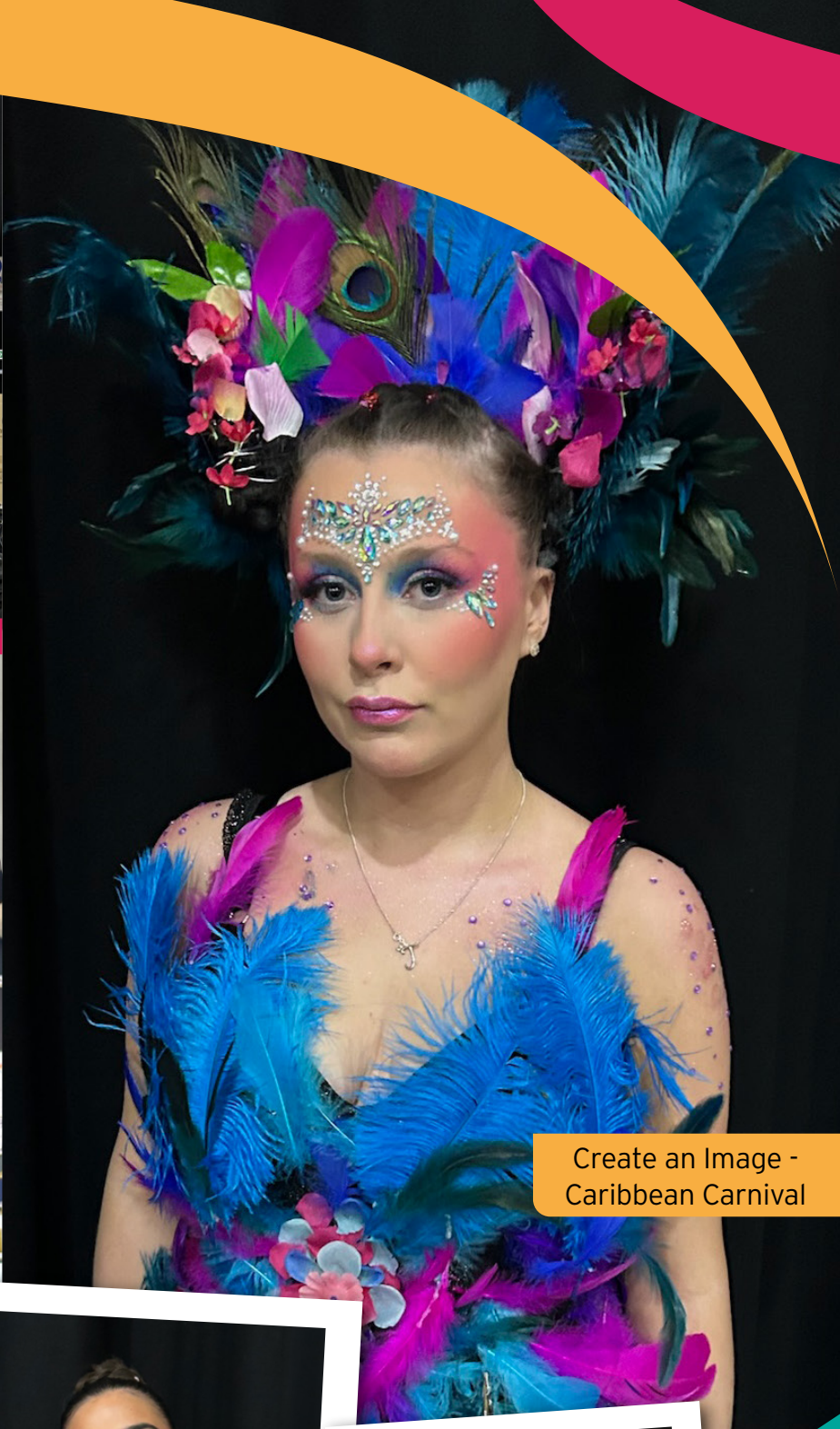
Create an Image - Caribbean Carnival