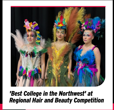
'Best College in the Northwest' at Regional Hair and Beauty Competition