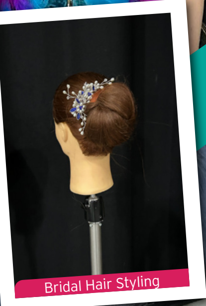
Bridal Hair Styling