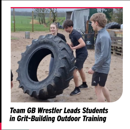
Team GB Wrestler Leads Students in Grit-Building Outdoor Training