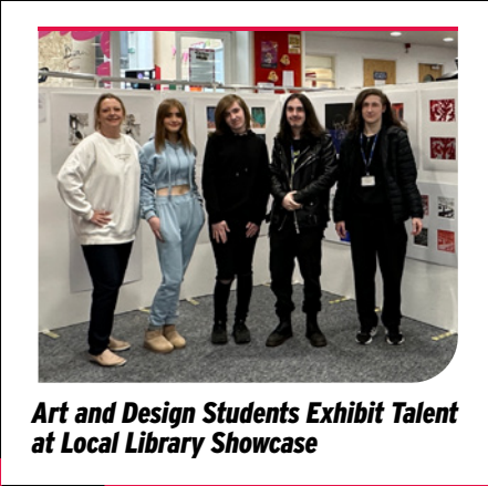
Art and Design Students Exhibit Talent at Local Library Showcase