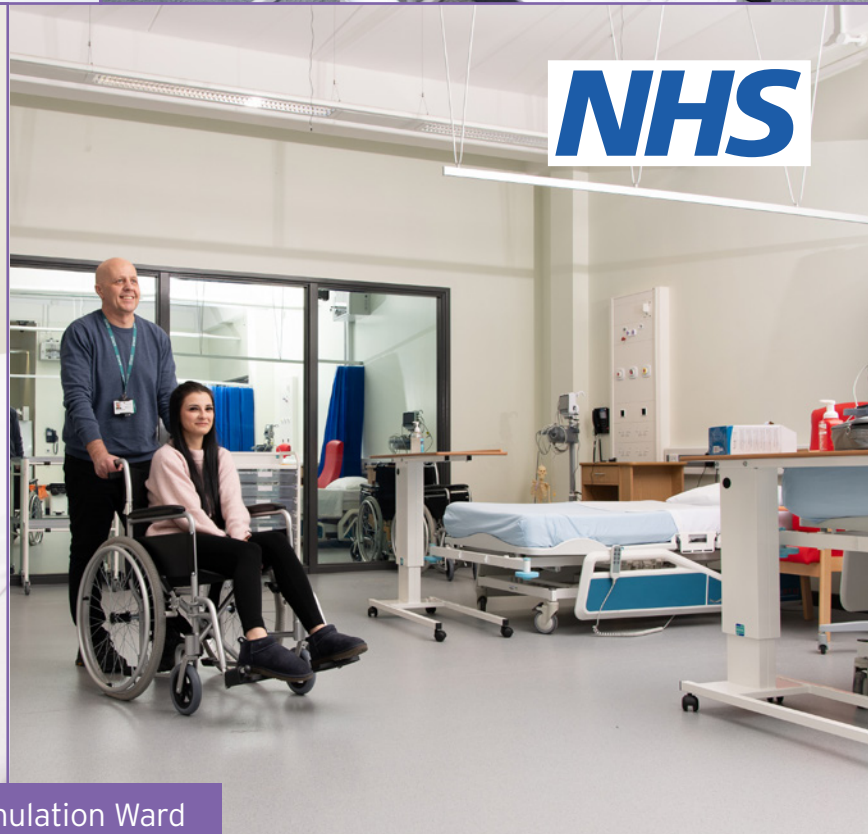
Hospital Simulation Ward