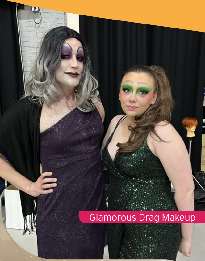
Glamorous Drag Makeup